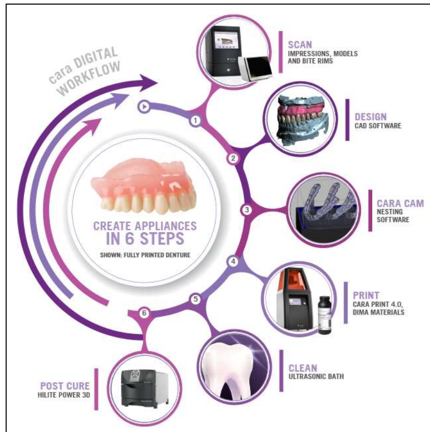
Fig 2: 3D technology for dental appliance