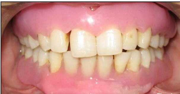
Fig 5: Removable appliance in mouth

A removable prosthesis was also designed for the patient for both the maxillary and mandibular arches and was given to the patient for use. (Fig.4,5,6)