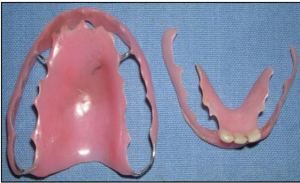
Fig 4: Removable appliance

A removable prosthesis was also designed for the patient for both the maxillary and mandibular arches and was given to the patient for use. (Fig.4,5,6)