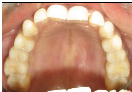
Fig 2: Maxillary Arch

The lingual surface were etched with 37% phosphoric acid for 20 seconds. Then the area is rinsed and dried thoroughly and bonding agent was applied and light cured for 20 seconds. Composite resin was then placed on the wire and light cured. Excess material was removed and finishing and polishing was done. The tooth were checked for mobility. Extraction of lower anterior deciduous teeth were done. (Fig.3)