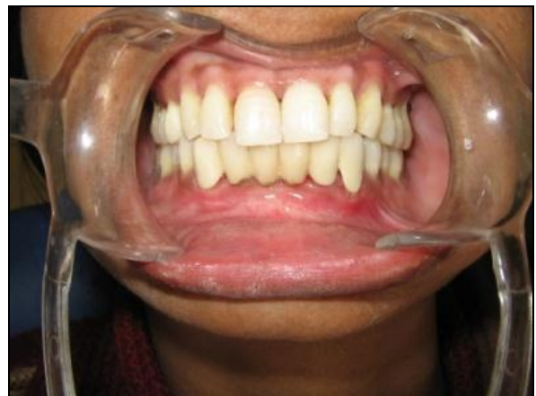
Fig 10: Final view