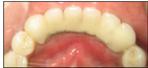
Fig 8: Fixed prosthesis

Patient reported after 3 months, and insisted for a fixed lower prosthesis as her wedding was finalized. Taking into consideration patient need a fixed prosthesis was planned from 33-43 i.e from canine to canine. Tooth preparation was done and impressions made, thereafter fixed prosthesis was made for the patient. (Fig.8,9,10)