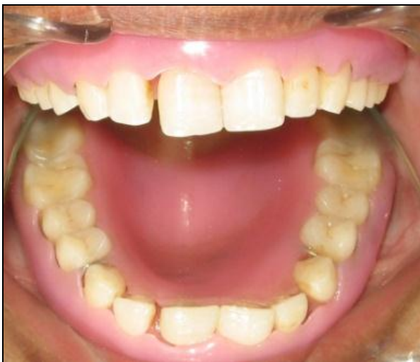
Fig 6: Maxillary view

Patient was given instructions on oral hygiene, advised to use interproximal brushes and was recalled after 3 months for review. (Fig.7)